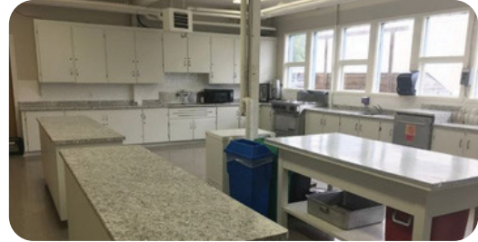
Auditorium w/Kitchen, $52/hr