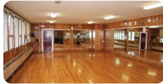
Fitness Studio, $33/hr

To check availability, visit http://townoflunenburg.ca/community-centre-programs-and-rentals.html