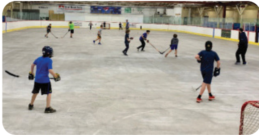
Lunenburg Arena, $84/hr ($811/day) From ball hockey, training courses, markets, festivals, shows and everything in between.