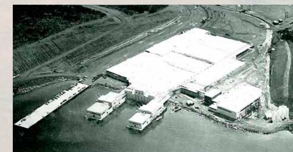
National Sea Products Plant - 1963