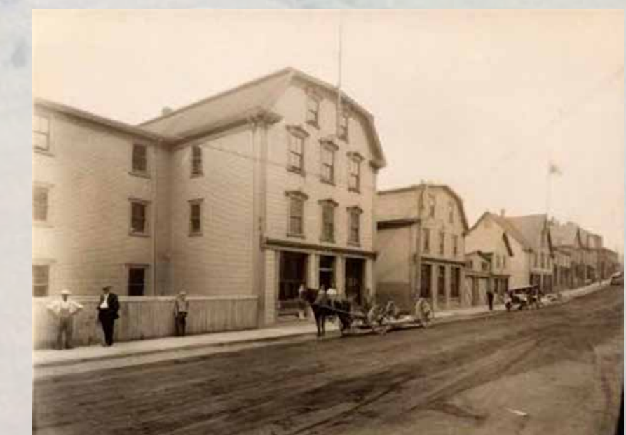
Zwicker and Company – 146 Bluenose Drive