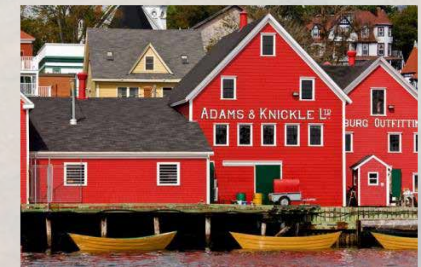
Adams and Knickle Ltd.