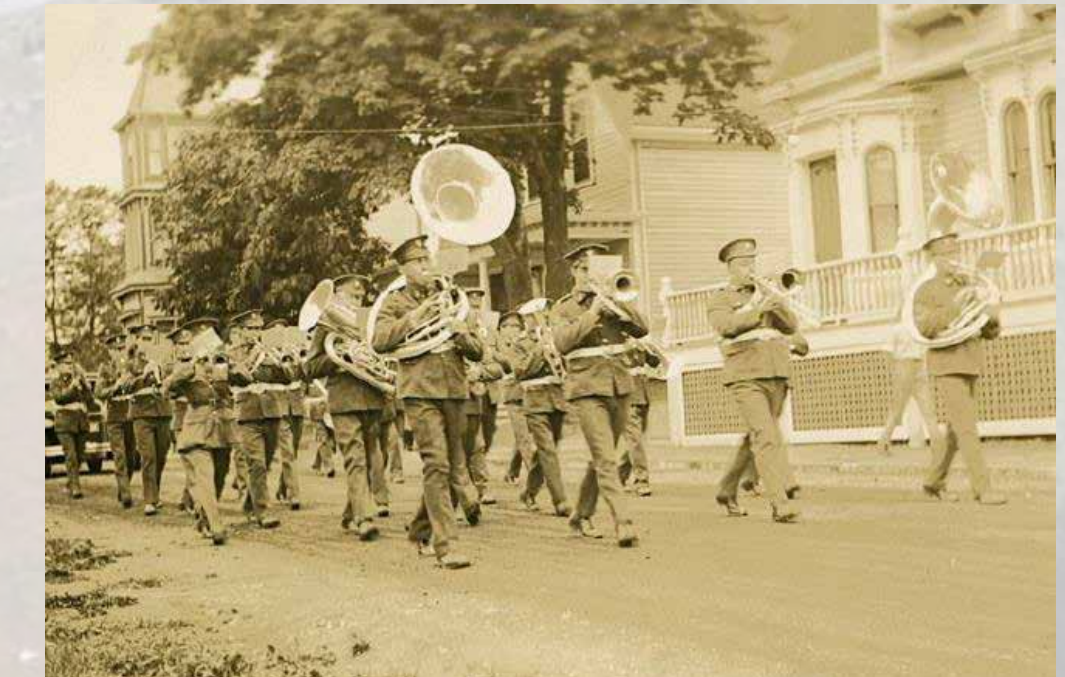
75th Battalion Band