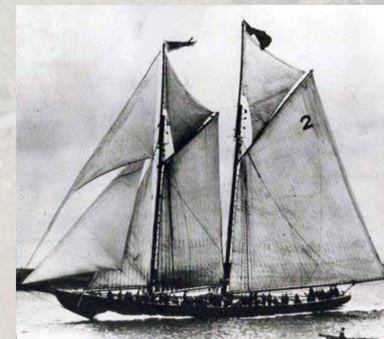
Bluenose: March 26, 1921