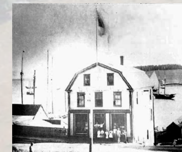
Office of W. C. Smith & Co. Today the location of the Dockside Restaurant - 90 Montague Street