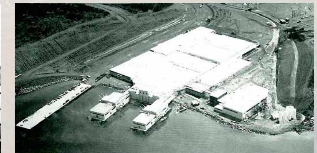
National Sea Products Plant - 1963