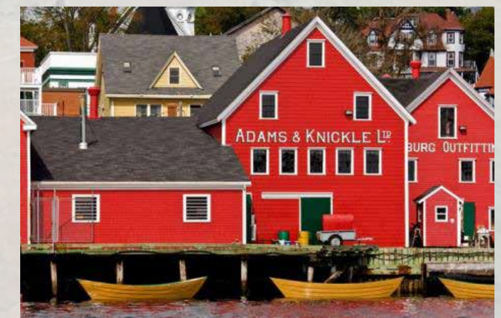
Adams and Knickle Ltd.