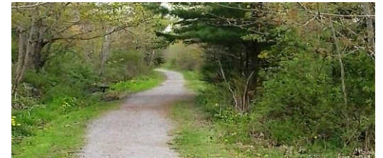
Back Harbour Trail

Explore the great outdoors on our trails!