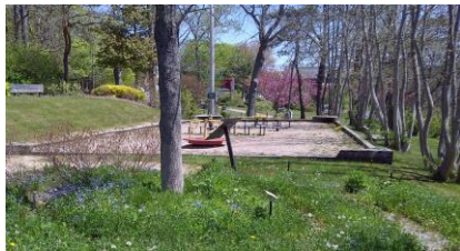
250 th Park Playground Medway Street (behind Fire Hall)