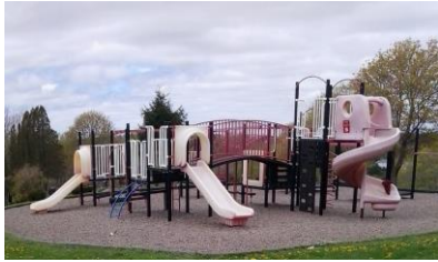
Lunenburg Academy Playground Kaulbach Street