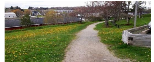
Front Harbour Trail (Harbourwalk)