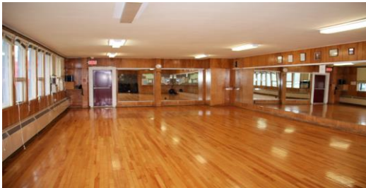
Fitness Studio/Meeting Room(s)