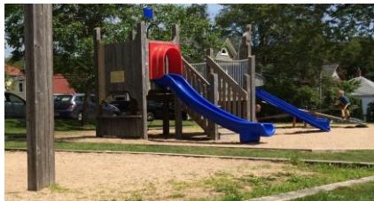
Townsend Street Playground Townsend Street (next to Town Hall)