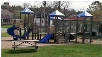
Victoria Street Playground Victoria Street (beside Tennis Court)