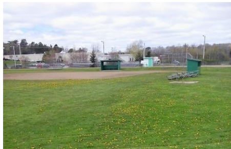
Baseball Field, Soccer Field, 400m Track, Basketball Courts